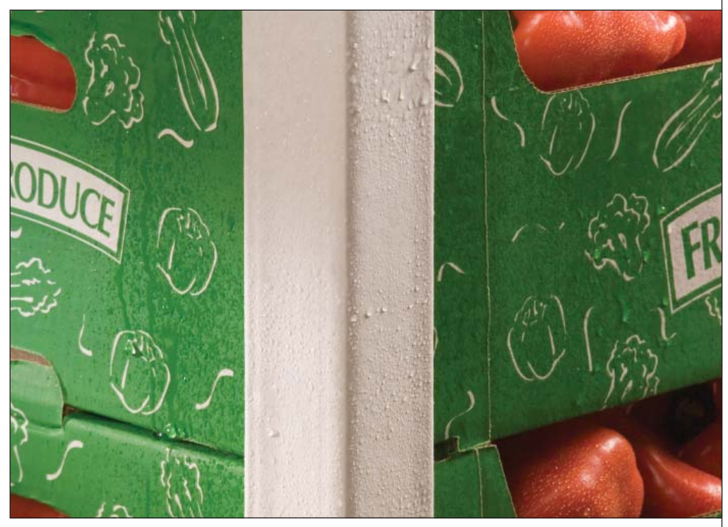
A special coating prevents water and moisture from being absorbed, allowing HydroShield to retain its structural strength.

HydroShield features a special water-resistant coating that helps maintain its protective integrity in environments where water or high humidity levels are present. The coating causes water and moisture to bead up and roll off before they can be absorbed into the product. This unique feature makes HydroShield particularly effective for edge protection and pallet stabilization in shipping and storing produce and other food perishables. HydroShield's moisture-resistant coating also can be applied to other Laminations products.