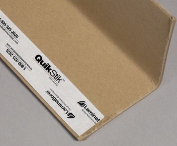
QuikStik features an easy-to-remove release liner.

Northwest 9750 SW Hillman Court Suite 100 Wilsonville, OR 97070 Toll Free: 1-800-685-2626 503-682-7195 FAX: 503-682-1723