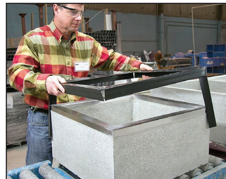
QuickCorner PalletTop® with hinged VBoard legs eliminates the need for tape while cutting the packaging process in half.

PF PalletTop consists of two pieces of notched VBoard that are riveted together on the ends and can be expanded to form a rectangle. The PalletTop pieces are placed on the bottom and top of the loads to cap and contain the corner protection of the VBoard on the four corners. In the case of the mop basins, the PF PalletTop conforms to the footprint of the basins. The corner VBoard pieces are 12 inches in length.