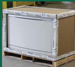
SUREContainer can be built around your product