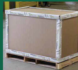
SUREContainer fully assembled